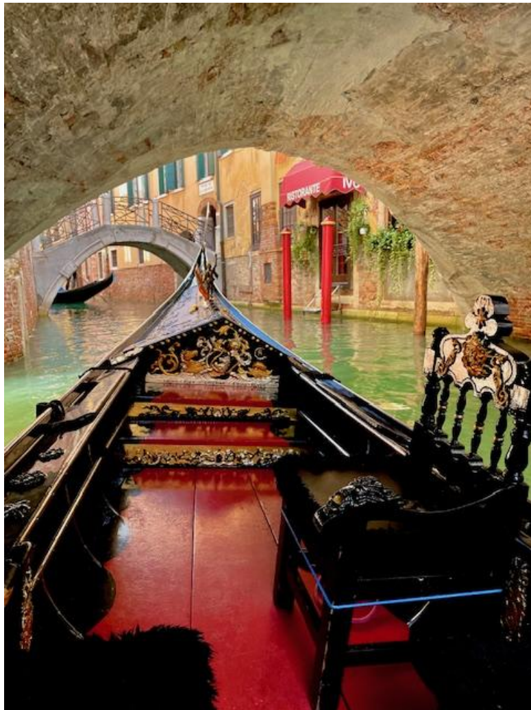
Venetian Canal

The cities of the world take on their unique characteristics in large part from their geography. This is especially true of Venice, which is poised between the cultures of the East and West and whose merchants plied the seas and served as a bridge between two cultures. A view of the city from the waters of the Adriatic reveals structures that could as easily be in Istanbul. The wealth generated through trade and conquest created a city of beautiful art and architecture,